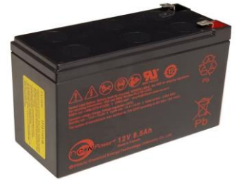
TPBAT12-9 12V 8.5Ah SLA AGM Battery