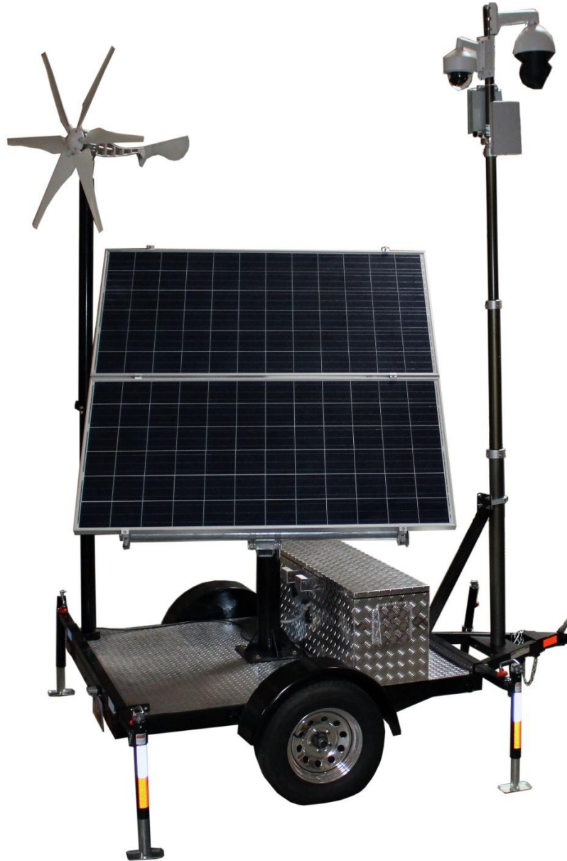
Typical Application with Wireless radio, Cameras and Wind Turbine Option

Caution! Voltage from the solar panels can exceed 65VDC. When connected to grid power, the AC voltage input will carry 120VAC or 240VAC. Be extremely careful when modifying any wiring or working around the solar controller or AC/DC battery charger. High Voltage can cause serious injury.