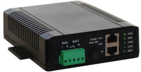
TP-SCPOE-2448-HP Charge Controller