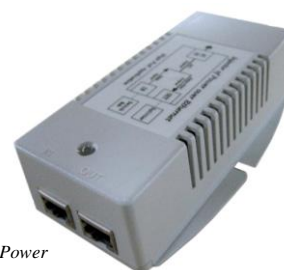
TP-POE-HP High Power