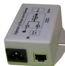
TP-POE Medium Power