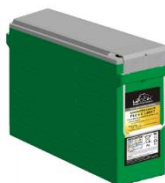
AGM 12V 180Ah Battery