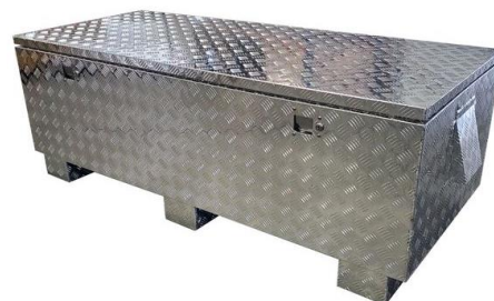
RPAL Diamond Plate Aluminum Ground Mount