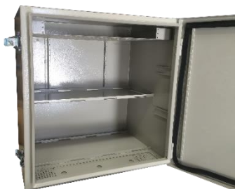
RPSTL Enclosure interior without batteries or controller