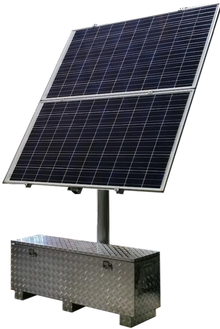
RPAL 720W Solar System