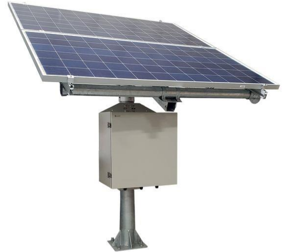
RPSTL 720W Solar System