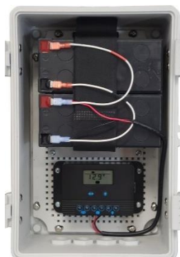
20A PWM Controller Inside