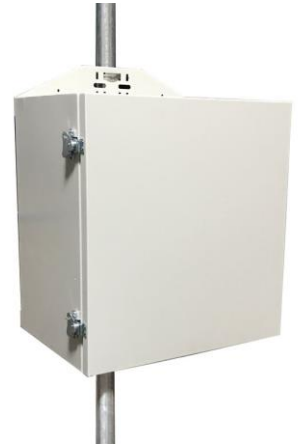
ENC-STL-24x24x16 Steel Enclosure

The enclosure is corrosion resistant for long service life. Enclosure material is powder coated steel. All hardware is stainless steel.